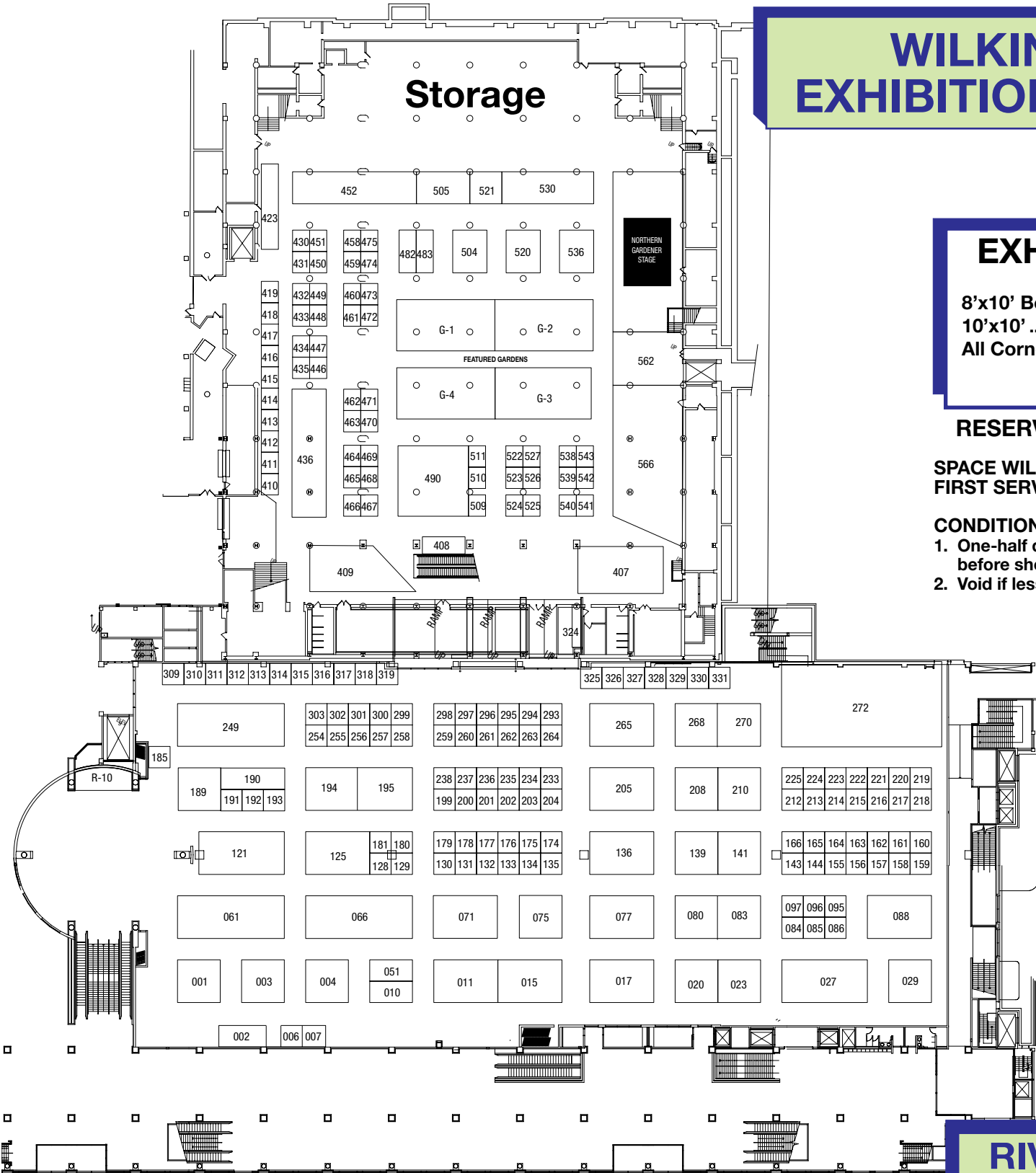
EXHIBIT BOOTH PRICES 8'x10' Booth..... $900 10'x10' ..... $950 All Corners ..... $25 Extra Call for Bulk Space Pricing

RESERVE YOUR EXHIBIT SPACE NOW!!! SPACE WILL BE ASSIGNED ON A FIRST COME FIRST SERVE BASIS. CONDITIONS FOR SPACE CONTRACTS: 1. One-half down with contract, total balance due 30 days before show. 2. Void if lessee fails to sign and return within 30 days.